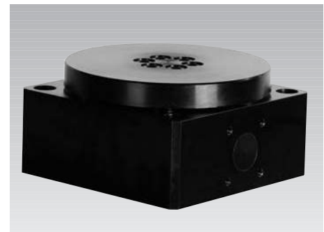
Rotating module - vertical axis DMV 1000 with flange plate Ø 170